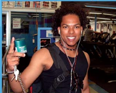
Sampling (manned & chilled available)