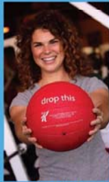
Branded Club Equipment