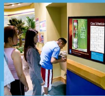
Digital advertising (video and static)