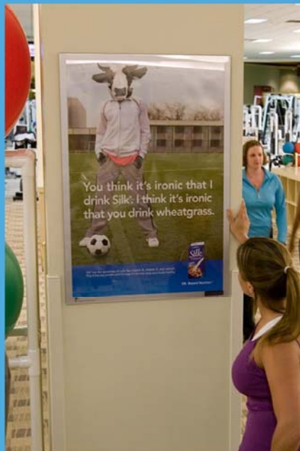
Static panel signage (backlit available)